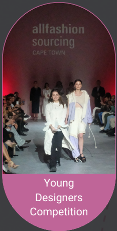
Young Designers Competition