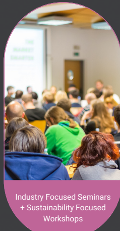
Industry Focused Seminars + Sustainability Focused Workshops