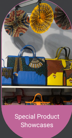
Special Product Showcases